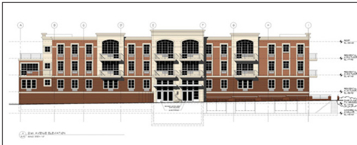
Plaza 21, Astoria